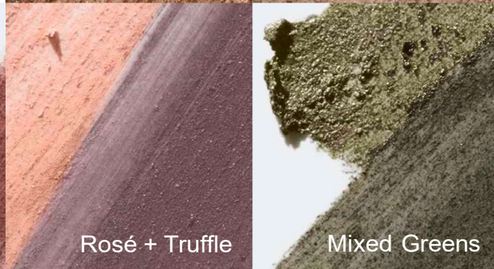
Rosé + Truffle