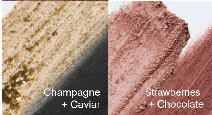
Champagne + Caviar