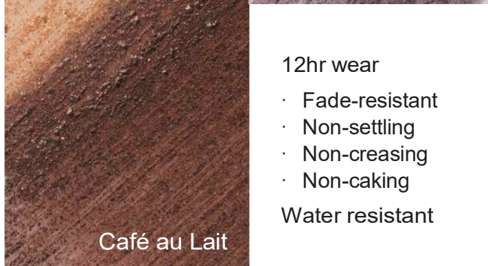
Café au Lait