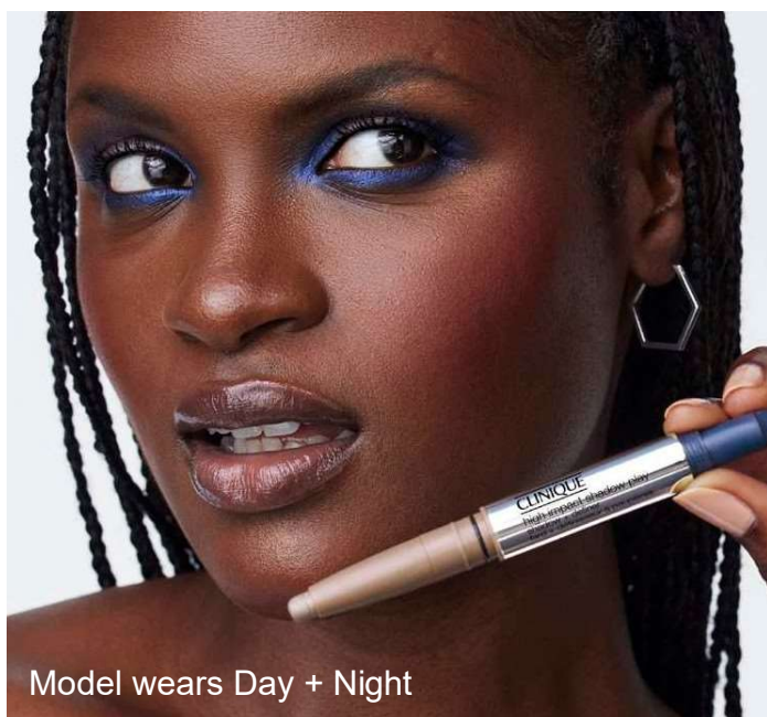
Model wears Day + Night

Powder Usage: Unscrew cap. Use sponge tip to apply powder shadow to eyelid as desired including lid, upper lash line, crease, and beneath lower lash line. To reload sponge with powder shadow, re-insert into cap. To close, screw cap onto threads of stick until snug.